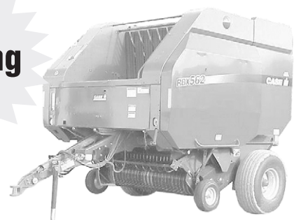
2003 CASE IH RBX562 Round Baler (hard core) CASH $19,500